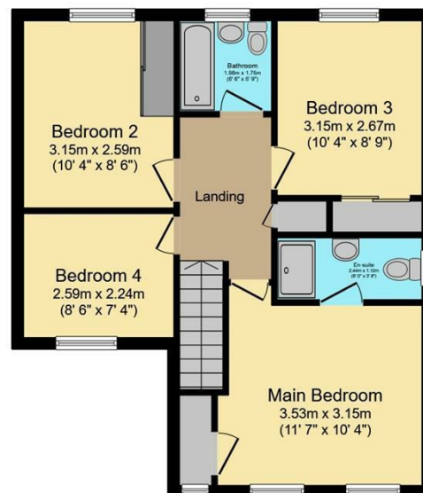
First Floor Floor area 52.8 sq.m. (568 sq.ft.)

Total floor area: 118.7 sq.m. (1,278 sq.ft.)